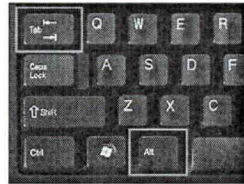
Figure 3. <Alt> + <Tab> on a keyboard