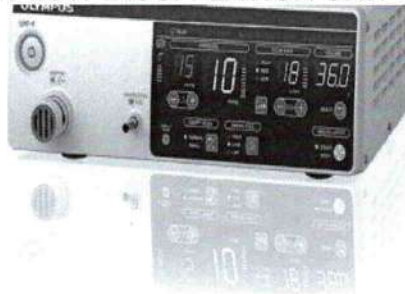
HIGH FLOW INSUFFLATION UNIT - UHI-4

Olympus has become aware of patients experiencing complications from over insufflation, including arrhythmias reported as "short cardiac arrests", gas embolism, and one death, during surgical procedures where UHI-4s were used.