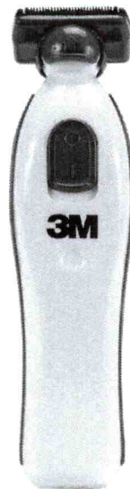
Catalog Number 9661L with 9660 blade