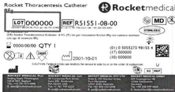
Figure 3: Location of Rocket Medical LOT numbers on labels

REGISTERED OFFICE IMPERIAL WAY WATFORD WD24 4XX